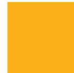
C0 M35 Y100 K0 R252 G175 B23 # fcac17 Pantone 1235