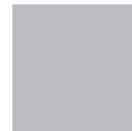
C0 M0 Y0 K30 R188 G189 B192 # bcbec0 Pantone Cool Gray 4