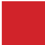
C15 M100 Y100 K0 R210 G35 B42 # d2232a Pantone 1797

The use of a neutral palette is recommended for applications where color images are central to the communication.