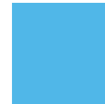
C60 M10 Y0 K0 R83 G183 B232 # 53b7e8 Pantone 298