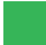
C75 M0 Y90 K0 R53 G181 B88 # 35b558 Pantone 360