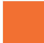
C0 M70 Y90 K0 R243 G112 B50 # f37032 Pantone 171