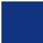
C100 M85 Y0 K25 R16 G53 B127 # 10357f Pantone 294