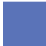
C70 M55 Y0 K0 R92 G115 B184 # 5c73b8 Pantone 646